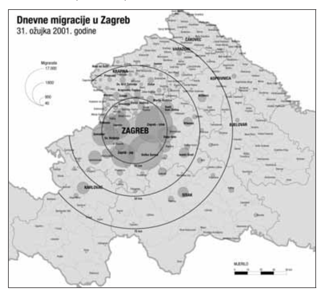
Fig.3: The spatial distribution of daily migrants to Zagreb in 2001 (radius is indicated at every 25km from Zagreb).

In relation to the situation thirty years ago, the spatial distribution of daily migrants in Zagreb's gravitational zone has changed. There is a drop in the number of daily migrants from distant settlements, and a proportional increase from nearer ones. Nowadays the greatest portion of daily migrants to Zagreb lives in a radius of up to 50 km from the city – about 90 percent.