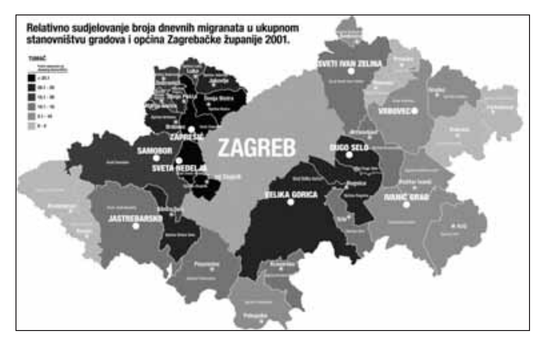
Fig.4: The percentile participation of daily migrants to Zagreb (out of the total number of inhabitants) in cities and municipalities of Zagreb County in 2001.

roads in particular, have adapted to this new transport structure. The highest intensity in daily migration and in the processes of suburbanisation occur in settlements that are closest to Zagreb and which have organised public transport to exurban areas. The Zagreb public transport authority, ZET, has 54 lines with 467 bus stations serving out-of-town areas in the settlements of the cities and municipalities of Velika Gorica, Zaprešić, Bistra, Luka, Stupnik, Klinča Selo and Jakovlje. The Croatian railway authority, Hrvatske eljeznice, maintains lines on two out-of-town routes: Dugo Selo-Zagreb-Savski Marof and Zagreb-Velika Gorica.