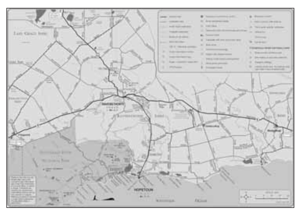
Fig. 4: Map of Shire of Ravensthorpe on Southern Coast of Western Australia.

The second case study, the Shire of Ravensthorpe, incorporates two small towns; Hopetoun, a quiet coastal town where, mostly, farmers chose to recreate in the summer or retire and Ravensthorpe 50 kilometres inland, which was the local service centre and the bigger of the two towns (see Fig. 4). After a large corporation, BHP Billiton announced in 2004 that it would develop a large nickel mine, the Ravensthorpe Nickel Operation (RNO), the Shire was transformed from being a small, marginal farming community to busy places with a local population dominated by an entirely different demographic, most of whom wanted to live in Hopetoun. It was anticipated that the mine, projected to be Australia's largest nickel laterite mine and processing plant, would be operational for about 25 years and that the returns to the State and the nation through royalties would be substantial. Like Boddington, previously inexpensive housing became highly sought after. House prices increased 588% between 1998 and 2008 (Rowley and Haslam McKenzie 2009).