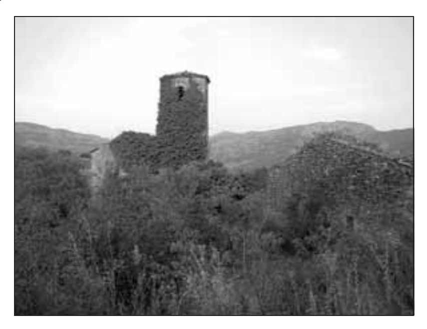
Fig. 5: Institutional awareness upon territory: forgotten and almost disappeared village (Escarlà, La Terreta).

nor for certifying their services. The connection between the owner and the customer is limited to the provision of accommodation; unlike in Austria, where each house (which remains a working farm) normally offers activities related to farming.