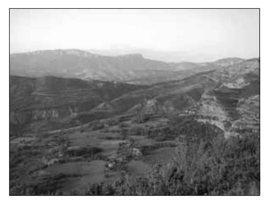
Fig. 2: Landscapes of abandonment: Reduction of cropland and settlements in Sapeira (la Terreta).

The Terreta is an example of an extensive mid-mountain territory (in the Pre-Pyrenees, as opposed to the higher altitude central axis of the mountain range) that began to undergo major changes around the mid-19<sup>th</sup> century (1850). At that time, the point of the greatest prosperity coincided with the impact of measures, taken by the new liberal state, in particular the process of disentailment, on the territory. With the objective of making a financial profit, attempts were made, through privatisation, to incorporate into the market economy areas of land for farming or forestry, which until that time had been in the hands of the Church or local corporations. However in many places, including the Terreta, these measures represented no more than a nominal change in ownership (the lands were not auctioned off, and a formal appropriation by the local residents of the municipality occurred).