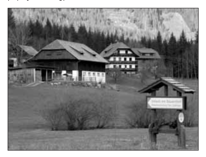
Fig. 4: Institutional awareness upon territory: "Urlaub am Bauernhof" near Metnitz.

In these terms, in the Terreta (specifically in the Catalan part) a tourist product has been developed based on its wildlife resources which exploits the relative anonymity of the area to attract alternative tourism (ecotourism, bird watching). On the other hand, the councils belonging to Aragon are also exploiting their architectural and archaeological resources in establishing a tourist product that is built more on the sum of its individual parts (Romanesque architecture, museums and interpretation centres) than any particular internal coherence. Likewise, some efforts have been made in the Metnitzer Berge to promote products such as former pilgrim routes, its gastronomy and the aforementioned timber industry. The strategy to promote tourism, however, seems to be well consolidated: at the regional level a number of tourist labels have been developed (like the "holidays region" – Urlaubsregion ), which employ a joint strategy.