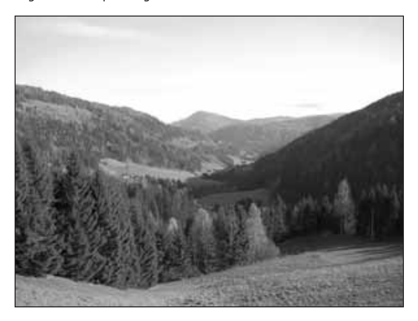
Fig.3: Landscapes of abandonment: Expansion of the forest over alpine pastures in the Metnitztal.