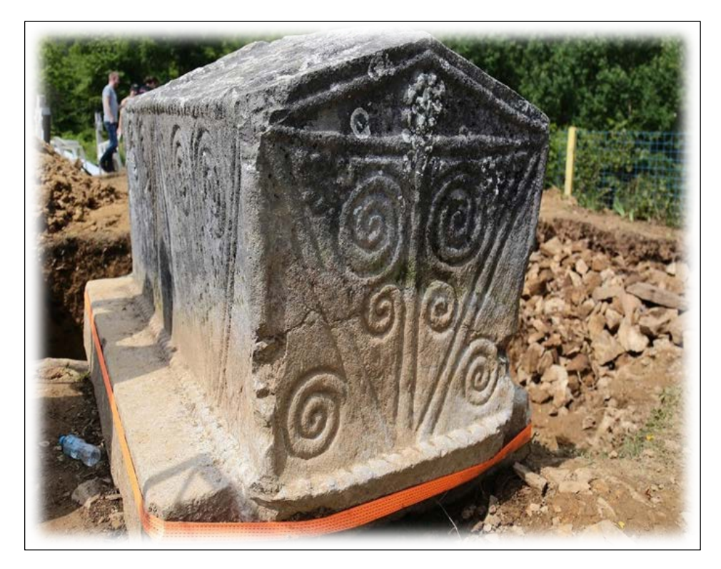
Fig. 4: Stecak Kneza Batica.

This is a rare case that one such cloak has been preserved for a period of timeof over 600 years and what makes it an extremely valuable find. The cloak is made of silver, fibers having a core of silk or cotton, depending on the period from which it dates. There are spirally woven lamellas of gold or gold alloys around it. Gold as a noble material keeps the fabric, and it is assumed that it is probably a bigger percentage of gold. However, the fabric is rather soft and damaged, as it is still about 600 years old. Another curiosity is that the person was buried without a head, meaning he was killed in a fight, so his body was sent here without a head, or he lost his head by punishment (http://www.ilijas.ba/).